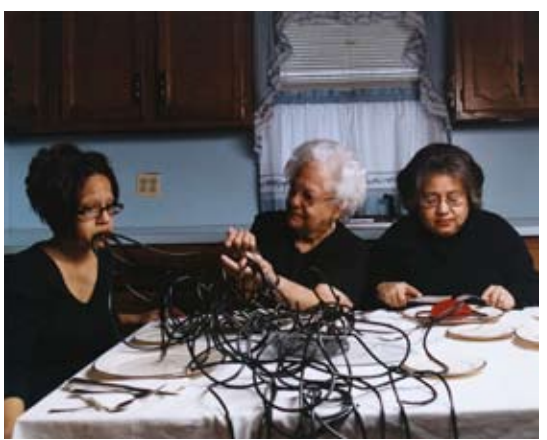
"Communiqué" C-print by Yanick Salazar

The Blood Dumpster is a NYC based artist's collective of all disciplines that seeks to discuss social, personal, political, and environmental topics with diverse interpretations, investigations and explanations of particular themes.